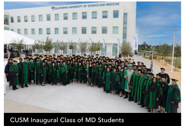
CUSM Inaugural Class of MD Students

Physician-Led | We are a uniquely physician-founded and physician-led organization that allows doctors and clinicians to direct healthcare at every level.