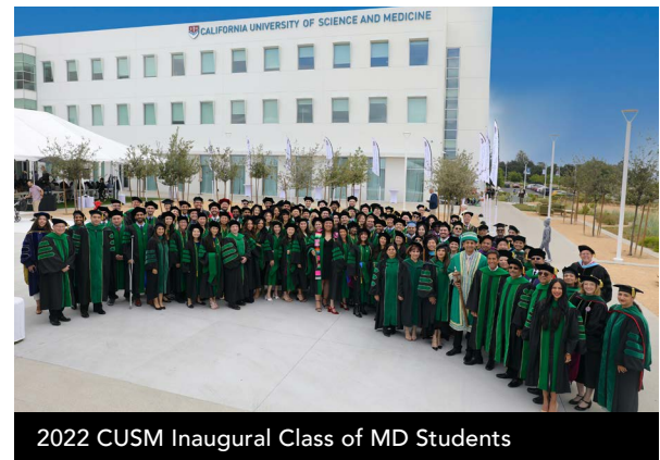
2022 CUSM Inaugural Class of MD Students

Physician-Led | We are a uniquely physician-founded and physician-led organization that allows doctors and clinicians to direct healthcare at every level.