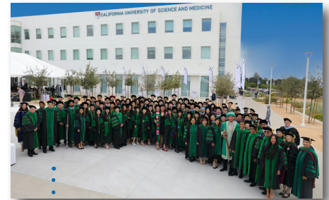
2022 California University of Science and Medicine Inaugural Class of MD Students

Physician-Led | We are a uniquely physician-founded and physician-led organization that allows doctors and clinicians to direct healthcare at every level.